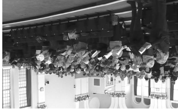
Sing Day February 2014

Salford Choral Society is proud of its tradition of music making in the North West, from its foundation in 1947 to becoming one of the North West's leading choirs, performing with professional soloists and orchestras. We perform five concerts a year in venues such as the Royal Northern College of Music in Manchester.